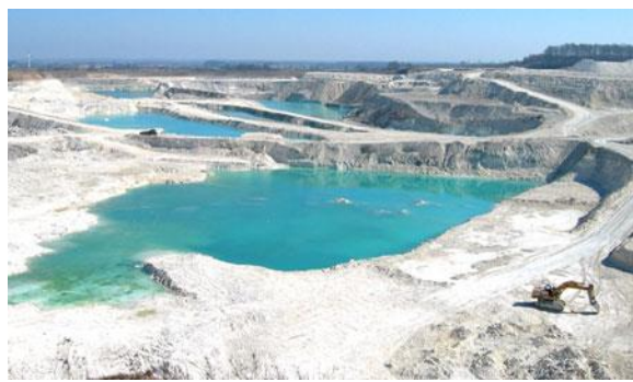
View at Faxe Kalkbrud seen from Danhostel Faxe